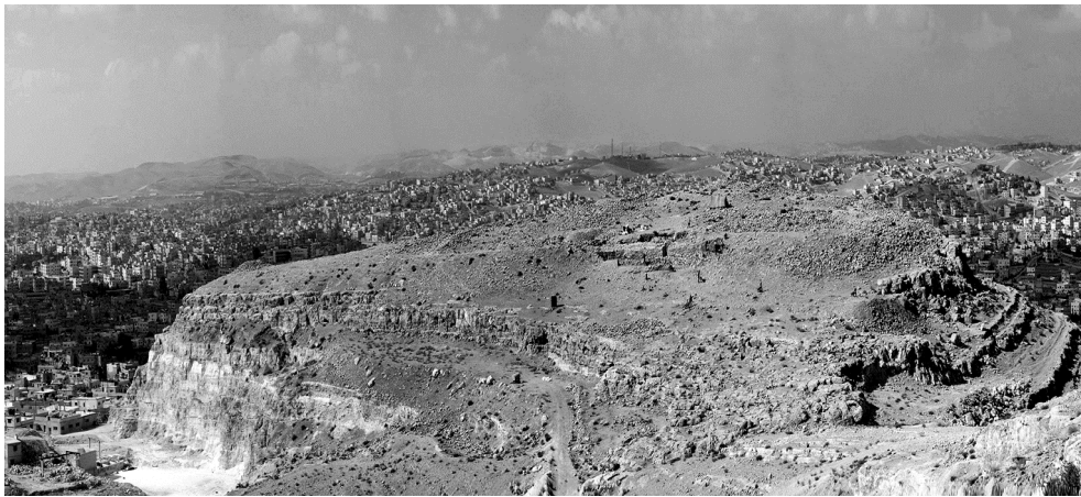
Fig. 0.1 - General view of the site of Khirbet al-Batrawy during the works at the northern fortification lines in season 2009, from north.

Archaeological activities carried on by Rome “La Sapienza” University at Khirbet al-Batrawy since 2005 1 , and in 2006 and 2007 2 , continued also in May - June 2008 and 2009 (fig. 0.1), stating a further commitment in the exploration of the Early Bronze Age II-III city and EB IV rural village, and in the systematic restoration of the main monuments uncovered so far (basically the Broad-Room Temple in Area F, the City-Walls and EB II City-Gate in Area B North; and Building B1 in Area B South).